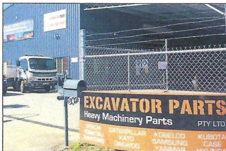
MAJOR MILESTONE: Australian-owned company Excavator Parts is celebrating 10 years in business this month.

Despite the global reach, family is really at the heart of the business, with Pe-